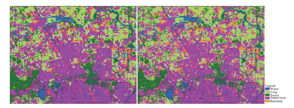
Figure 2. Land-cover updating using the ITSS with (left) and without (right) the MRF model.